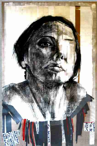
FRIFRÙ, 2009, by Sonia Ceccotti, at GiaMaArt studio, Italy

GiaMaArt studio Via Iadonisi 14 Vitulano (BN) +39 0824 878 665 info@giamaartstudio.it www.giamaartstudio.it Facce Riciclate (Recycled Faces), an investigation on portrait, opens March 28. Artist, Sonia Ceccotti introduces her characters, including herself, through an aesthetic construction made of wrapping material for delivering goods: corrugated cardboard, coloured sticky and insulating tape, bar codes creating details, charcoal sharp strokes giving life to glances